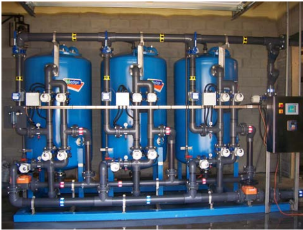
Example Triplex APU26 Skid Mounted System