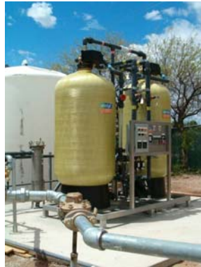
After Installation May, 2004