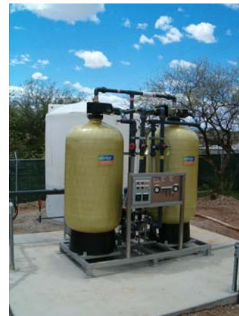
APU-100 System – Rimrock, Arizona Arsenic Treatment Demonstration

In mid 2003, AdEdge Technologies Inc. (AdEdge) was selected to implement three full scale arsenic treatment Demonstration Projects with USEPA using its granular ferric oxide (GFO) technology. At the Rimrock location, implementation began in September, 2003 including engineering submittals and permitting by the Arizona Department of Environmental Quality (ADEQ). Upon completing site preparations and construction in early March, AdEdge installed the new 100 gpm Adsorption Package Unit (APU) arsenic treatment system at the Montezuma Haven well site. This system was AdEdge's second installation for a public drinking water system in Arizona utilizing GFO technology. Historically, arsenic levels reported in the source wells serving the community ranged from 50 to 55 parts per billion (ppb), over five times the new USEPA standard of 10 ppb. A complete water profile was obtained on the source water to assess the water chemistry and predict performance. The table below lists some of the more important water-quality parameters.