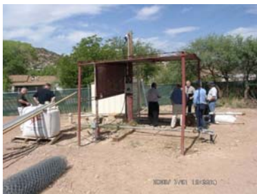
Site Before Treatment July, 2003

Rimrock, AZ EPA Project 35 gpm flow rate, 12 hr/day pH 7.2 Arsenic influent: 50-60 ppb ave Lead / Lag configuration June, 2004 began treatment Results through 65,000 bed volumes treated to date