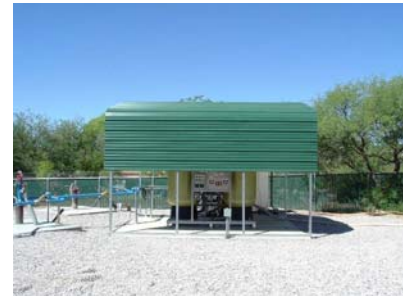
With Shade Structure June, 2004